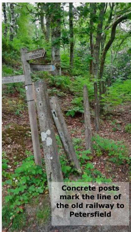
Concrete posts mark the line of the old railway to Petersfield