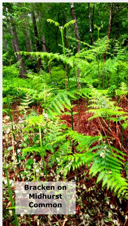
Bracken on Midhurst Common