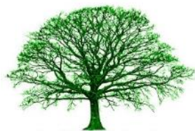
The Midhurst Society

It might seem, since we cancelled our public talks, that we have been inactive during Lockdown, but in some areas we continue to beaver away. We devoted many hours to the production of our latest Midhurst Magazine (Issue 31) to mark the 60th anniversary of our formation. If you paid for this with your annual subscription, and have not yet received a copy, please let us know. Copies are available to purchase at Dummers and the Bepton Road Spar Shop, or can be bought through our website.