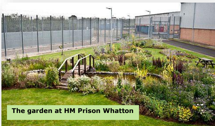
The garden at HM Prison Whatton

Many prisons of course had always kept their grounds in good order with annual bedding and providing vegetables for the kitchens. None of the inmates were obliged to work in the gardens and all of them were volunteers who wished to learn and hopefully find a suitable post once released. The numbers in each prison garden varied with often twenty or thirty inmates keen to be outside. The standard of horticulture also varied according to the skills of the prison warden allocated to manage these often